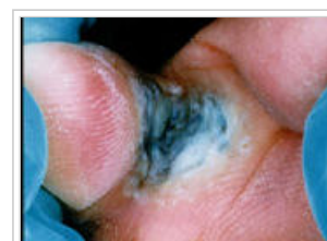
Pseudomonas infection of the hand

However, research indicates that salicylic acid can inhibit pyocyanin production. [15] One in ten hospital-acquired infections are from Pseudomonas . Cystic fibrosis patients are also predisposed to P. aeruginosa infection of the lungs. P. aeruginosa may also be a common cause of "hot-tub rash" (dermatitis), caused by lack of proper, periodic attention to water quality. The most common cause of burn infections is P. aeruginosa . Pseudomonas is also a common cause of post-operative infection in radial keratotomy surgery patients. The organism is also associated with the skin lesion ecthyma gangrenosum.